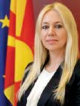
Dr. Shiret Elezi Minister of Local Self Government